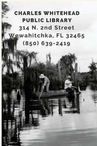
CHARLES WHITEHEAD PUBLIC LIBRARY 314 N. 2nd Street Wewahitchka, FL 32465 (850) 639-2419

Please call for an appointment at 850-639-2419