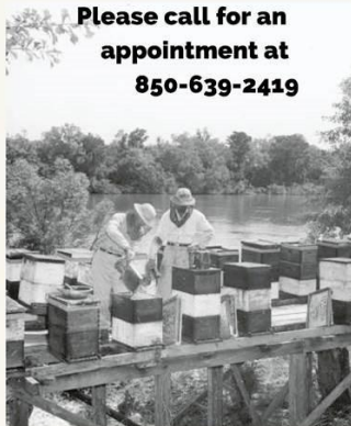
Preserving Wewahitchka's History